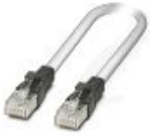
Patch cable, CAT5, assembled, 5 m

Patch cable - FL CAT5 PATCH 5,0 - 2832580