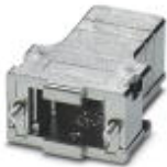
D-SUB sleeve housings, degree of protection: IP20, material: ABS, metal-plated, cable outlet: straight, size of housing: 1, color: Bare metallic

D-SUB sleeve housings - CUC-DST-GPME-S/DSSC9 - 1419705