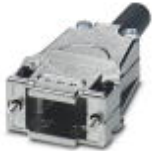
D-SUB sleeve housings, degree of protection: IP20, material: Zinc die-cast, cable outlet: straight, size of housing: 1, color: Bare metallic

D-SUB sleeve housings - CUC-DST-GZNI-S/DSSC9 - 1419722