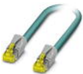
Patch cable, CAT6 A , 4-pair, shielded, connection not crossed (line), assembled at both ends with RJ45/IP20 connectors, outer sheath material: PUR, length: 3.0 m

Patch cable - NBC-R4AC/10G-R4AC/10G-94F/3,0 - 1408365