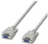
RS-232 cable, 9-pos. D-SUB socket on 9-pos. D-SUB socket, 9-wire, 1:1

Data cable - PSM-KA9SUB9/BB/2METER - 2799474