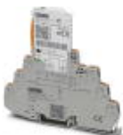
Surge protection, consisting of protective plug and base element, with integrated status indicator and knife disconnection for three signal wires with common reference potential. For HF applications and telecommunications interfaces without supply voltage. Indirect grounding via gas-filled surge arrester.

Surge protection device - TTC-6P-3-HF-F-M-24DC-PT-I - 2906797