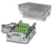
D-SUB plug, 9-pos. female connector, one cable entry < 35°, universal type for all systems, pin assignment: 1, 2, 3, 4, 5, 6, 7, 8, 9 to screw connection terminal block

D-SUB bus connector - SUBCON 9/F-SH - 2761499