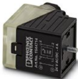
Valve connectors, Universal, 3-position, Valve connector A, with 1 LED, connected with Zener diode, Screw connection, cable gland M16, external cable diameter 5 mm ... 10 mm

Please be informed that the data shown in this PDF Document is generated from our Online Catalog. Please find the complete data in the user's documentation. Our General Terms of Use for Downloads are valid ( http://phoenixcontact.com/download )