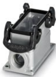
HEAVYCON box mounting base B24, with double locking latch, height 67 mm, with support 1xM25

Please be informed that the data shown in this PDF Document is generated from our Online Catalog. Please find the complete data in the user's documentation. Our General Terms of Use for Downloads are valid ( http://phoenixcontact.com/download )