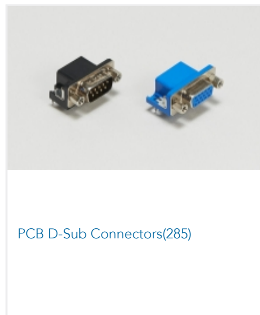
PCB D-Sub Connectors(285)