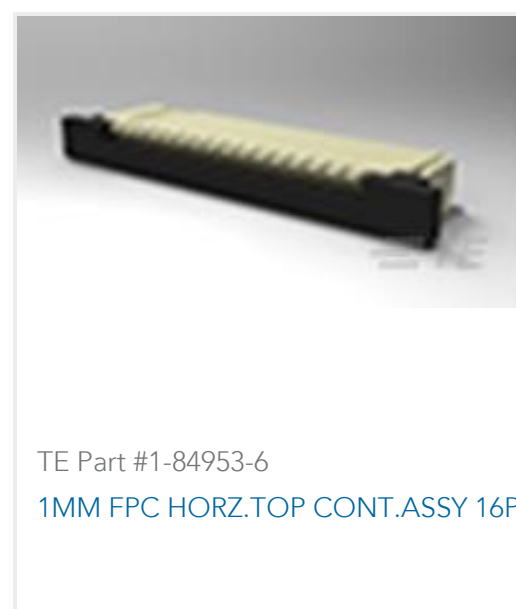
TE Part #1-84953-6 1MM FPC HORZ.TOP CONT.ASSY 16P