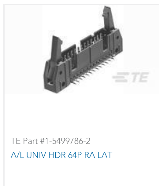
TE Part #1-5499786-2 A/L UNIV HDR 64P RA LAT