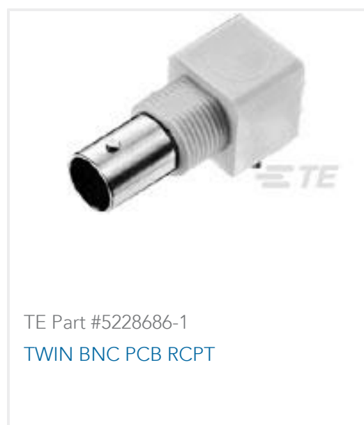
TE Part #5228686-1 TWIN BNC PCB RCPT