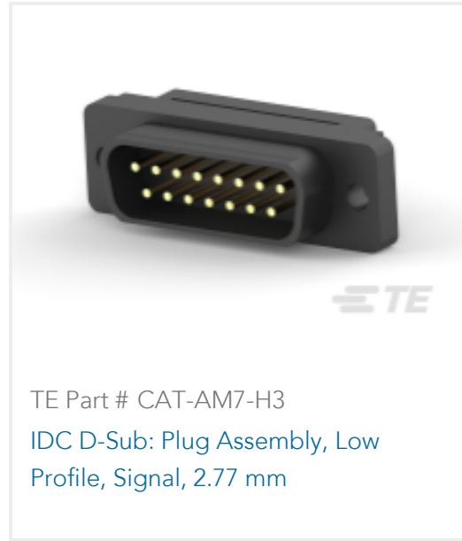
TE Part # CAT-AM7-H3 IDC D-Sub: Plug Assembly, Low Profile, Signal, 2.77 mm