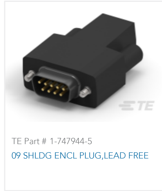
TE Part # 1-747944-5 09 SHLDG ENCL PLUG, LEAD FREE