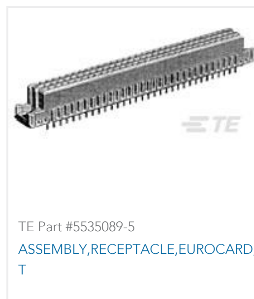
TE Part #5535089-5 ASSEMBLY, RECEPTACLE, EUROCARD, T