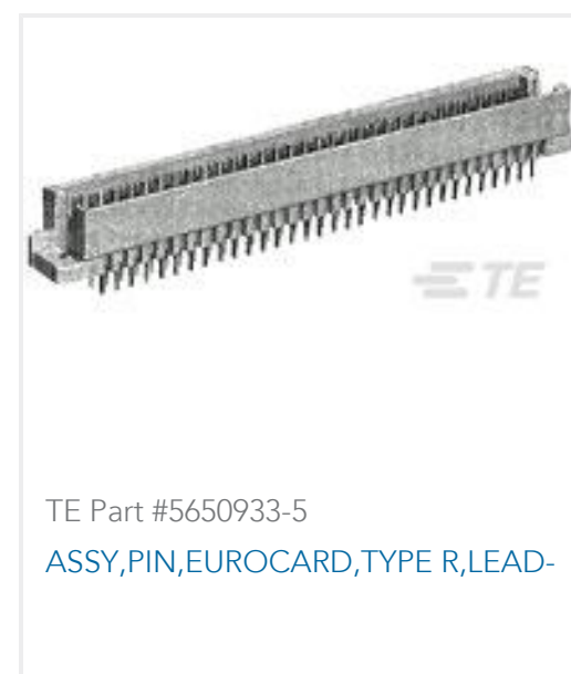
TE Part #5650933-5 ASSY, PIN, EUROCARD, TYPE R, LEAD-T