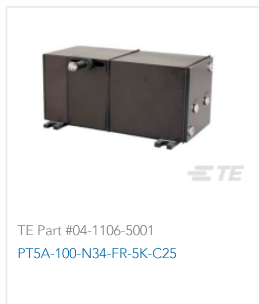
TE Part #04-1106-5001 PT5A-100-N34-FR-5K-C25