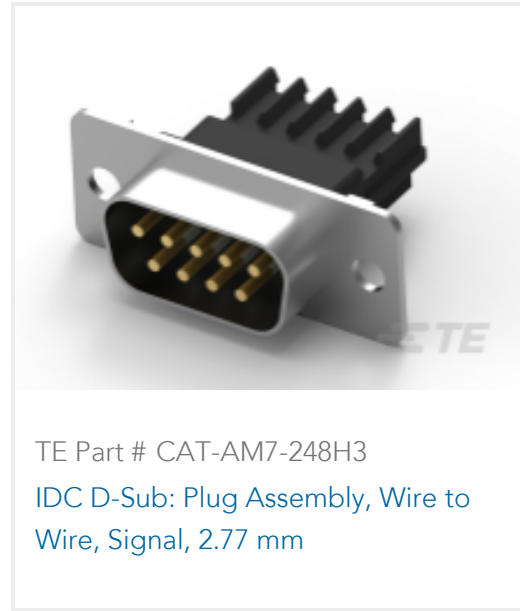
TE Part # CAT-AM7-248H3 IDC D-Sub: Plug Assembly, Wire to Wire, Signal, 2.77 mm