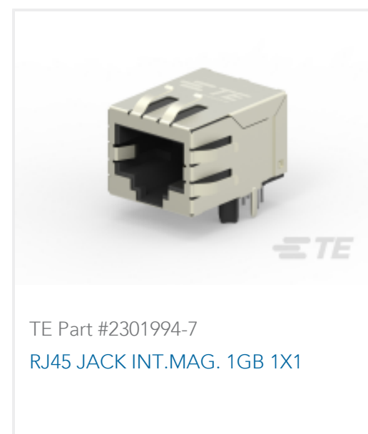
TE Part #2301994-7 RJ45 JACK INT.MAG. 1GB 1X1