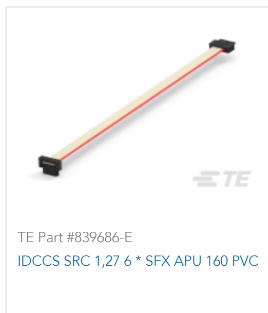
TE Part #839686-E IDCCS SRC 1,27 6 * SFX APU 160 PVC