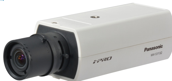
Lens : Optional