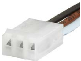
Wire Harness Wire harness for SCHURTER products