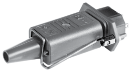
Cord retaining kits Cord retaining strain relief