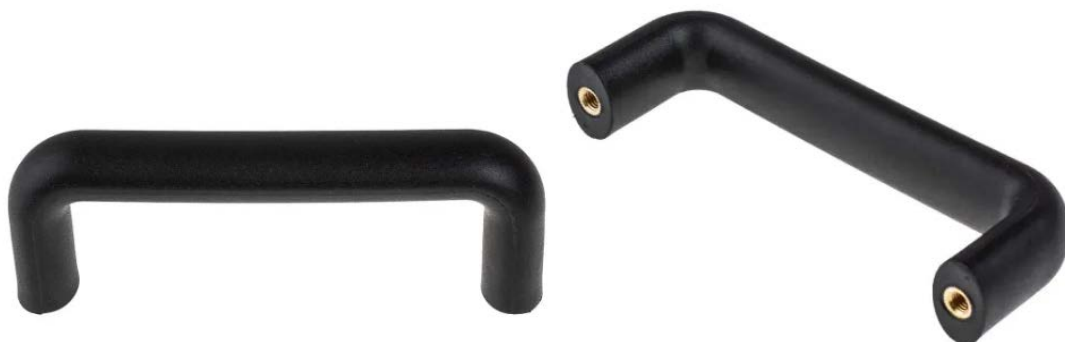
Bridge Handle Model 07 - Nylon - Concealed