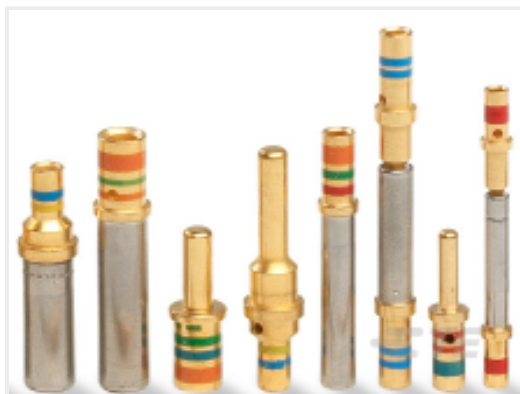
TE Part #38943-22L CONT SOC ASSY