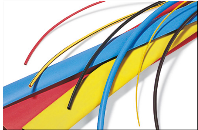
TF21 – available in a wide range of colours and sizes.

Detailed Information about Heatguns please refer to page 317/318.