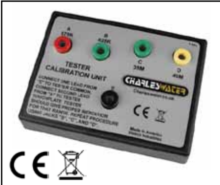
Figure 1. Charleswater 99090 Tester Calibration Unit