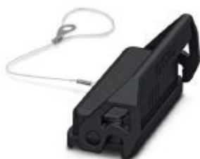
Protective cover D25, with single locking latch, protective cover material: PA, height: 19 mm

Please be informed that the data shown in this PDF Document is generated from our Online Catalog. Please find the complete data in the user's documentation. Our General Terms of Use for Downloads are valid ( http://phoenixcontact.com/download )