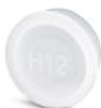
Plastic dust protection cap for connectors with M23 external thread

Plastic dust protection cap - RC-Z2059 - 1604225