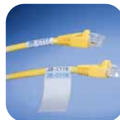
Wire & Cable ID