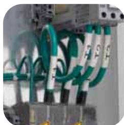
Wire Marking Sleeves