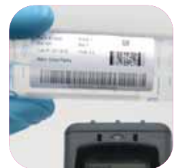
Lab & Healthcare Identification