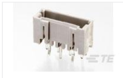
TE Part #292207-2 MINI CT SGL DIP V 2P NAT