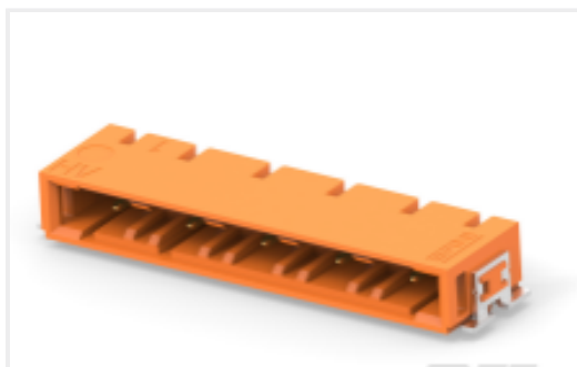
TE Part #524233-E SRCA 6,20 5 M * SMD 137 E-HD 205 * ** J