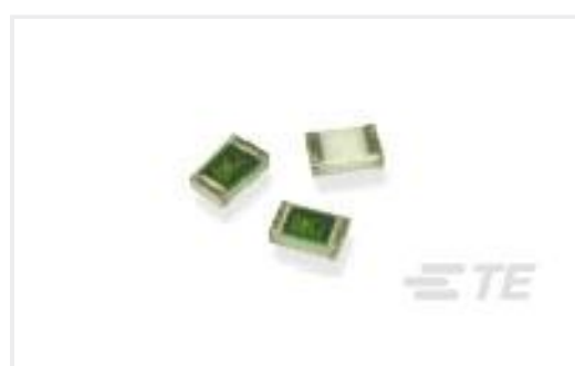
TE Part #1676169-2 RN 0805 124R 0.1% 10PPM 1KRL