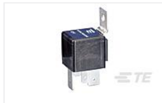
TE Part #3-1414937-3 V23134J0065X497-EV-CBOX