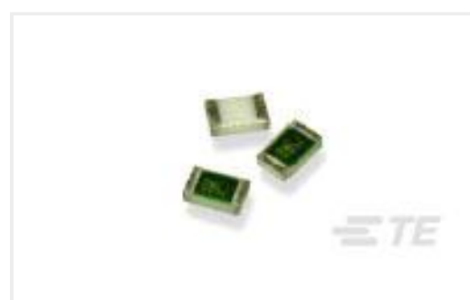
TE Part #3-1879216-0 CPF0402 120K 0.1% 25PPM 1K RL