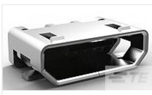
TE Part #2174507-2 MICRO USB, TYPE B