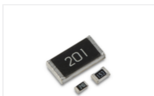
TE Part #2-2176329-7 CRGP 1210 1K5 1%