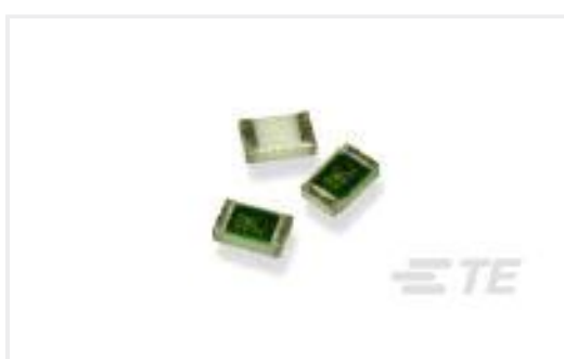
TE Part #1614906-2 CPF0805 20K 0.1% 25PPM 5K RL