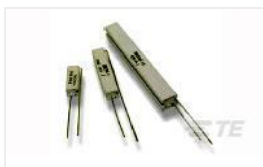
TE Part #1-1623732-9 BCHE 7 W 1R5 10%