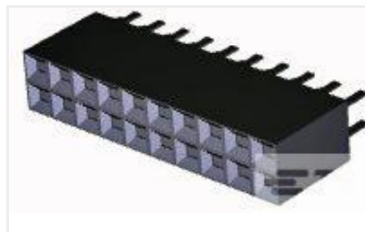
TE Part #1-534998-0 20 MODIV VRT DR CE 100/125