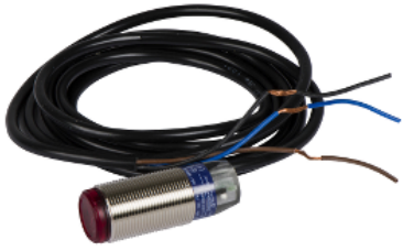
photo-electric sensor - XUB - receiver - Sn 15m - 12..24VDC - cable 2m