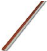
Continuous plug-in bridge, length: 500 mm, color: red

Continuous plug-in bridge - FBST 500-PLC RD - 2966786