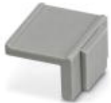
Equipment marker, width 12 mm