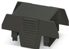
DIN rail housing, Upper housing part, flat design, connection opening on both sides, width: 35.1 mm, height: 74.65 mm, depth: 36.95 mm, color: black (similar RAL 9005)

Please be informed that the data shown in this PDF document is generated from our online catalog. Please find the complete data in the user documentation. Our general terms of use for downloads are valid.