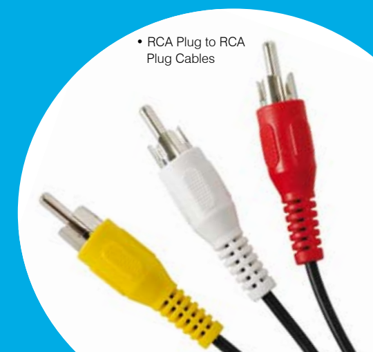
• RCA Plug to RCA Plug Cables