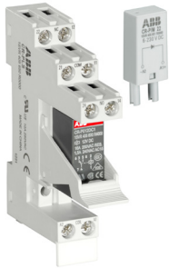
CR-P complete version