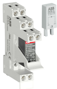
CR-P complete version