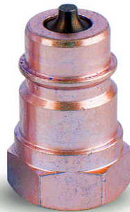
Male Self-Sealing Coupler – (e.g. 745-4700)