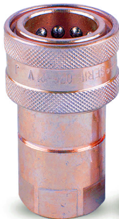
Female Self-Sealing Coupler – (e.g. 745-4704)