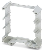
DIN rail housing, Intermediate element, flat design, without vents, width: 22.6 mm, height: 85 mm, depth: 90 mm, color: light gray (similar RAL 7035)

Please be informed that the data shown in this PDF document is generated from our online catalog. Please find the complete data in the user documentation. Our general terms of use for downloads are valid.