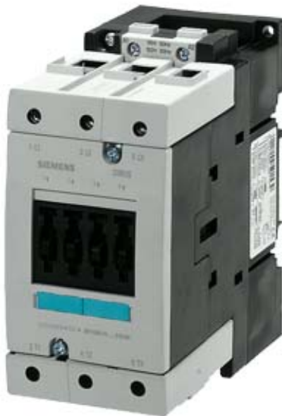
CONTACTOR, AC-3 37 KW/400 V, AC 110 V, 50 HZ, 3-POLE, SIZE S3, SCREW CONNECTION