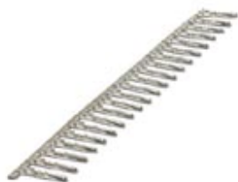
Rolled female contact, taped, silver-plated, 0.5 mm 2 ... 1.5 mm 2 left contact lead-in, 2000 pieces per roll

Please be informed that the data shown in this PDF Document is generated from our Online Catalog. Please find the complete data in the user's documentation. Our General Terms of Use for Downloads are valid ( http://phoenixcontact.com/download )