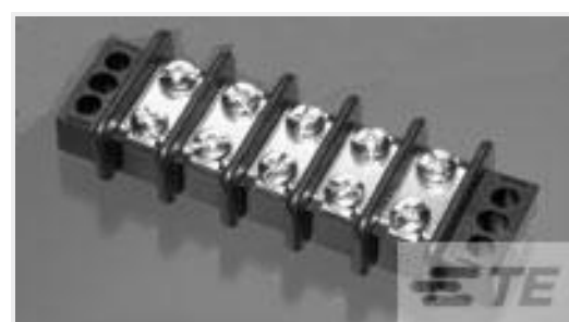
TE Part #1546307-2 2P .374" DR BARRIER, W/WASHER