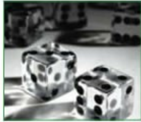
15,000:1 Contrast Ratio