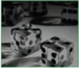
2000:1 Contrast Ratio

Bright 2600 ANSI Lumens, Perfect for projecting in lights on environments. And with DarkChip3™ technology from Texas Instruments combined with Eco+ technology produces a stunning 15,000:1 contrast ratio for pin sharp graphics and crystal clear text. Crisper whites, ultra-rich blacks make images come alive and text easier to read - ideal for business and education presentations.