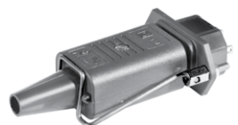
Cord retaining kits Cord retaining strain relief