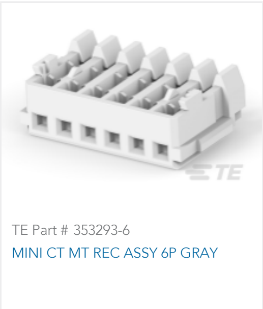
TE Part # 353293-6 MINI CT MT REC ASSY 6P GRAY