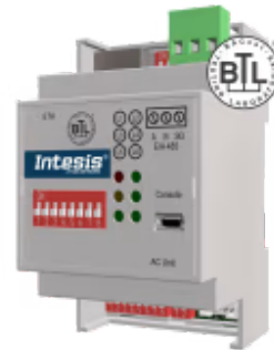
Mitsubishi Electric Domestic to BACnet/IP & MS/TP - 1 indoor unit

The Mitsubishi Electric-BACnet interface allows full bidirectional communication between Mitsubishi Electric domestic, Mr. Slim, and City Multi air conditioner units and BACnet/IP or MS/TP networks. It enables BACnet communication via polling or subscription requests (COV), making the indoor unit available through independent BACnet objects.