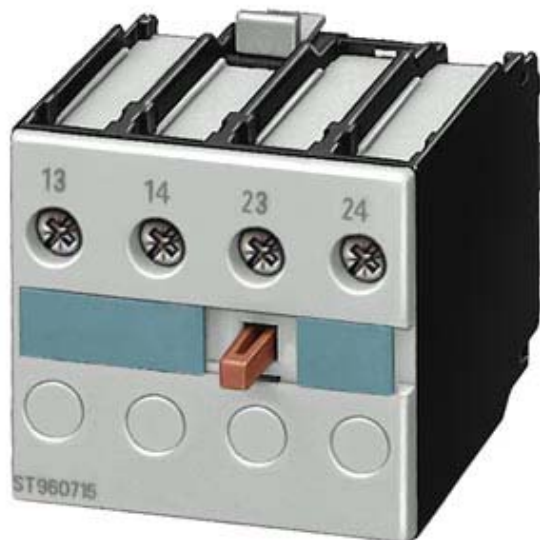
AUXILIARY SWITCH BLOCK, DIN EN 50005, 1NO+1NC, CABLE ENTRY FROM ABOVE SCREW CONNECTION, FOR CONTACTORS FOR SWITCHING MOTORS, 2-POLE