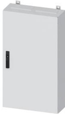
ALPHA 400, wall-mounted cabinet, Flat Pack, IP43, Protection class 1, H: 950 mm, W: 550 mm, T: 210 mm, RAL 9016