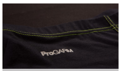
Innovative stitching pattern for improved com-