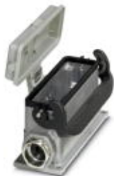
Box mounting base, with single locking latch, height 67 mm, with screw connection, 1x M25, with protective cover

Please be informed that the data shown in this PDF Document is generated from our Online Catalog. Please find the complete data in the user's documentation. Our General Terms of Use for Downloads are valid ( http://phoenixcontact.com/download )