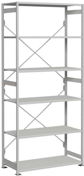
Mono – Open Frame