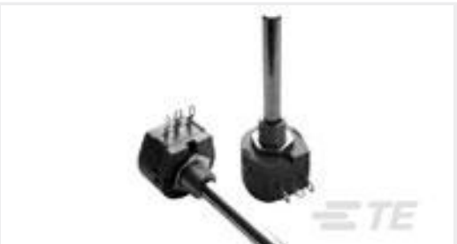
TE Part #1676979-4 TW 1W 10K 6.35X25PL