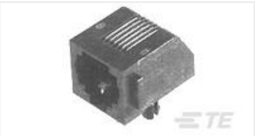
TE Part #5569026-1 MJ,LPF,R/A,6P,HTN