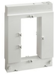
Current transformers DM4TA3000