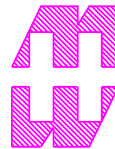
VIEW INSIDE LID