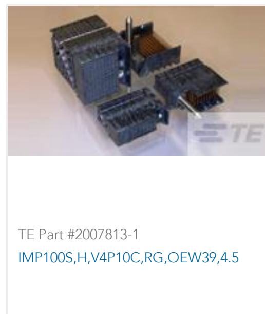
TE Part #2007813-1 IMP100S,H,V4P10C,RG,OEWS39,4,5