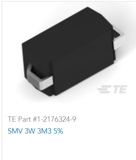
TE Part #1-2176324-9 SMV 3W 3M3 5%