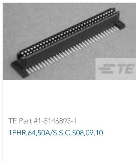
TE Part #1-5146893-1 1FHR,64,50A/S,S,C,S08,09,10