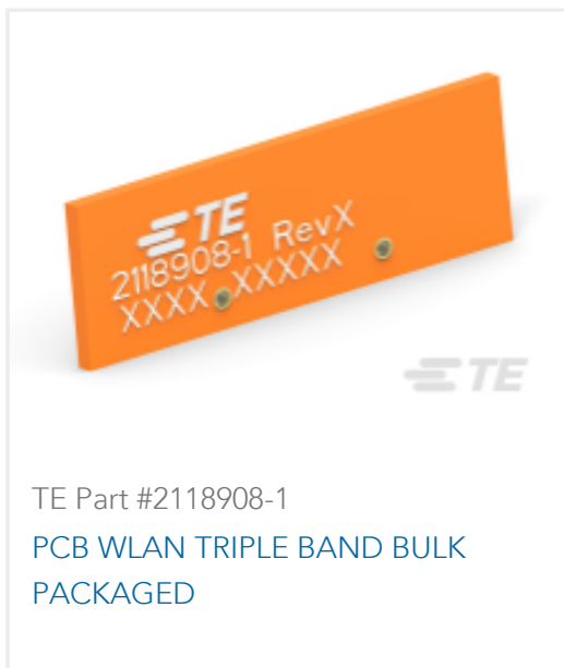
TE Part #2118908-1 PCB WLAN TRIPLE BAND BULK PACKAGED