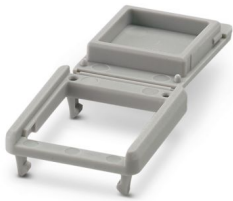
Dust protection cover

https://www.phoenixcontact.com/pc/products/1041860