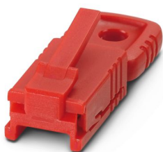
Port Guard Security Element

https://www.phoenixcontact.com/pc/products/1041900