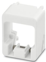
Plug Guard Security Frame

https://www.phoenixcontact.com/pc/products/1041881