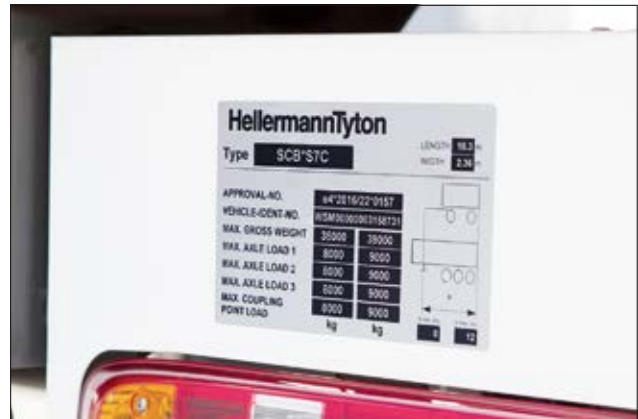
Type plate of an HGV trailer with protective laminate.