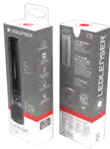
For illustration purposes only