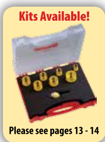
Please see pages 13 - 14

Constructed of hardened heat and abrasion resisting high speed steel teeth with a tough alloy body and cap, and designed for use with battery operated power tools, our Smooth Cutting Hole Saws will cut twice as many holes as the equivalent standard hole saw per battery charge.